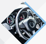
Car interior & exterior parts

Ultrasint® PA11 is suitable for a wide range of applications from automotive to medical.